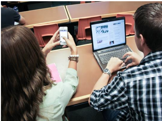
Students typically engage in off-task computer activities and using social media 66% of the time in class.